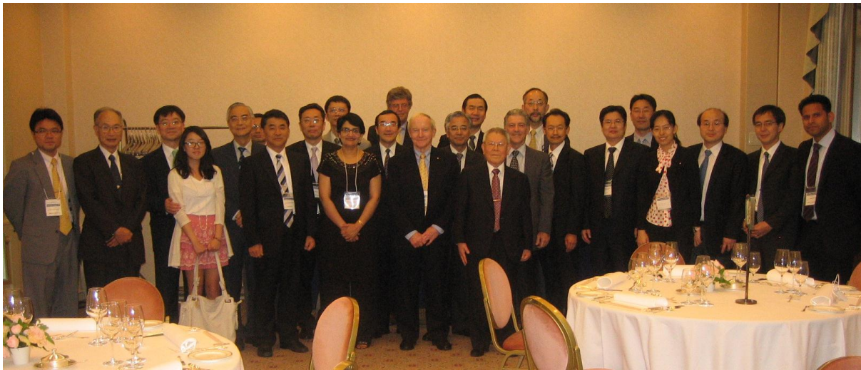
The Pulse of Asia board members gathered at Welcome party

The pulse of Asia in 2010 is proven to be a successful symposium! The 3 rd Pulse of Asia will be held on Nov. 4-5 th 2011 in conjunction with the annual meeting of 13 rd International Symposium on Hypertension and Related disease at Beijing, China.